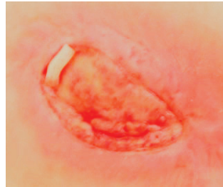
JULY 6 6.0 cm x 2.6 cm: Flap surgery canceled. (PolyMem Wic visible in deep cavity, but no more undermining).