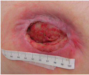
JUNE 13 6.5 cm x 4.0 cm. Clean after 13 days of PolyMem. 3.0 cm of undermining is filling in. Was 3-9 o'clock, now 6-9 o'clock.