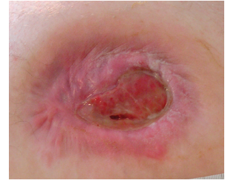
JULY 29 4.6 cm x 2.2 cm with no undermining. Dismissed to home care after 9 weeks of PolyMem use.