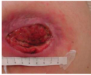
JUNE 30 No manual cleansing at dressing changes – the dressing continuously cleanses the wound.