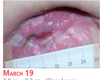
MARCH 19 2.0 cm x 0.2 cm. (Closed again completely in April)