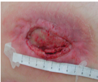
JUNE 23 Undermining is filling in rapidly and the infection is gone.