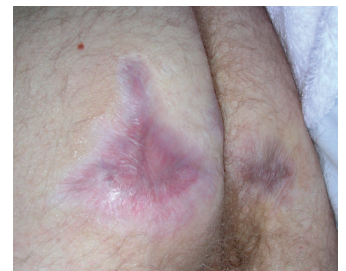
The other nine ulcers remained closed. The man returned to work (75%) the following year.

It is quite likely this individual could have been spared at least 1½ years of pain if we could have used PolyMem continuously from the first time he came to our facility.