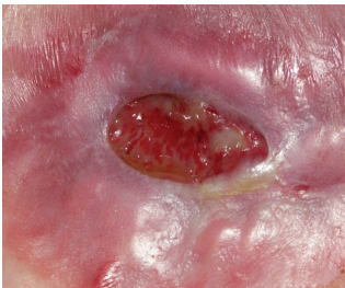
DEC 30 2.4 cm x 1.4 cm. Good progress towards wound healing, even at home.