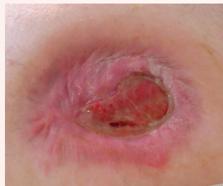
JULY 29 AFTER ONLY 9 WEEKS OF POLYMEM USE, UNDERMINING IS RESOLVED. DISMISSED TO HOME CARE