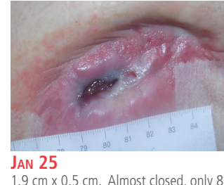
JAN 25 1.9 cm x 0.5 cm. Almost closed, only 8 months after initiating the use of PolyMem.