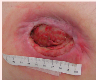
JUNE 13 AFTER 13 DAYS OF POLYMEM USE, WOUND IS CLEAN. 3.0 CM OF UNDERMINING IS FILLING IN.