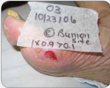
INITIATION OF POLYMEM MANAGEMENT