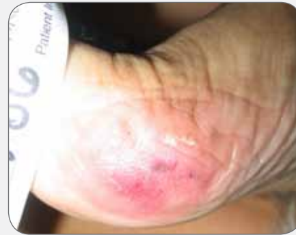
SIX WEEKS OF POLYMEM MANAGEMENT