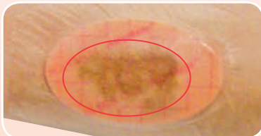
If infection is present, treat appropriately