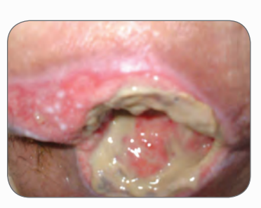
SEPT 30, 2006 After only 2½ weeks, yellow slough and exudate are already reduced without additional cleansing or rinsing. Dressing changes are now daily. Pain is 0!