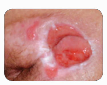
NOV 11, 2006 Wound continues to decrease in depth, undermining and circumference using PolyMem Silver dressings changed daily with no cleansing.